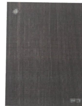
Star wood 291